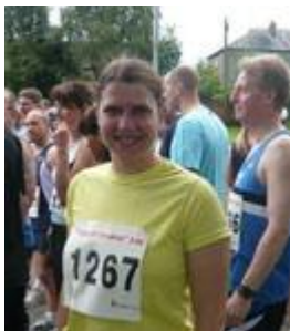
Jo Swinson the Liberal Democrat MP for East Dunbartonshire, a PPS to

4. Jo's marathon for leukaemia research Target: £2,620.00 Raised so far: £2,770.40 If you would like to sponsor Jo go to: www.justgiving.com/jo-swinson